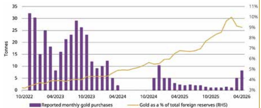
Chart 3: The 18th non-stop monthly Chinese gold reserve addition The PBoC's reported gold purchases and gold's share of total foreign exchange reserves*